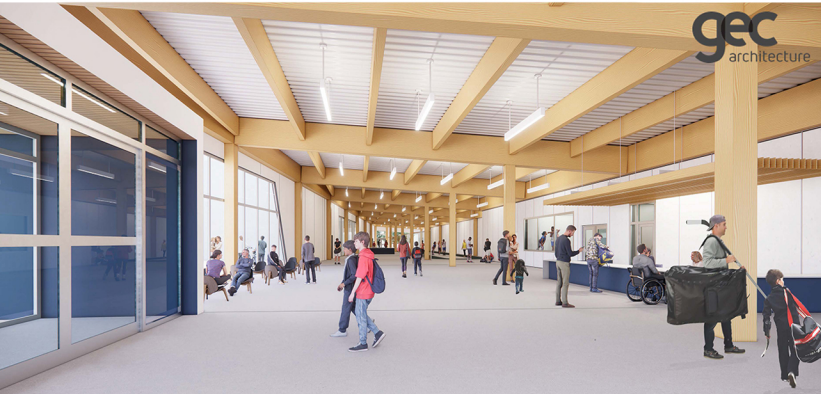
New Entrance Lobby