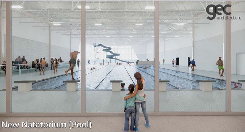
New Natatorium (Pool)