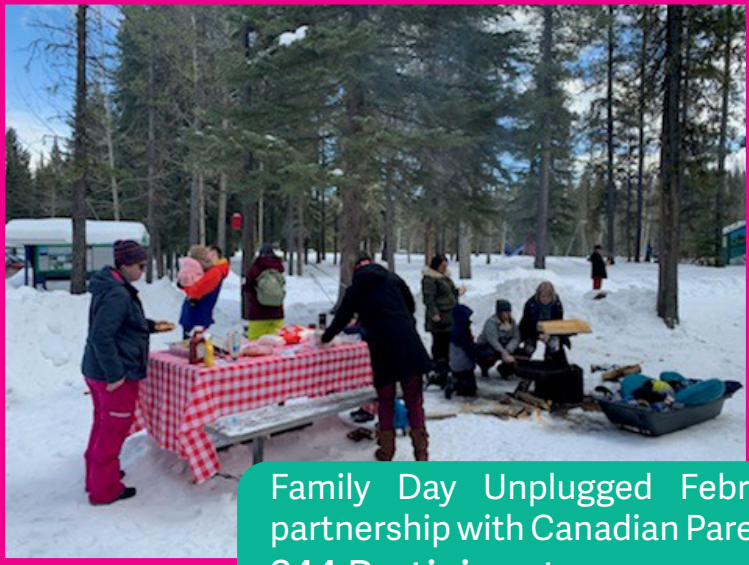
Family Day Unplugged February 2020 in partnership with Canadian Parents for French. 244 Participants 9 Volunteers 36 Volunteer Hours