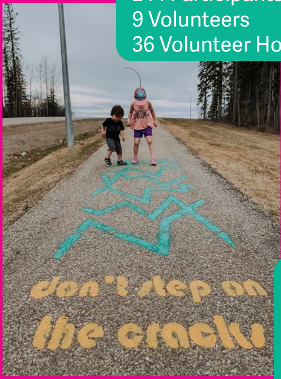
FCSS and The Primary Care Network purchased stencils for Community Development use on Edson trails and sidewalks. 4 Volunteers 24 Volunteer Hours