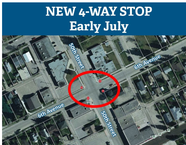
NEW 4-WAY STOP Early July

If you have any questions or concerns regarding the changes, please contact the Protective Services Department at 780-723-3178.