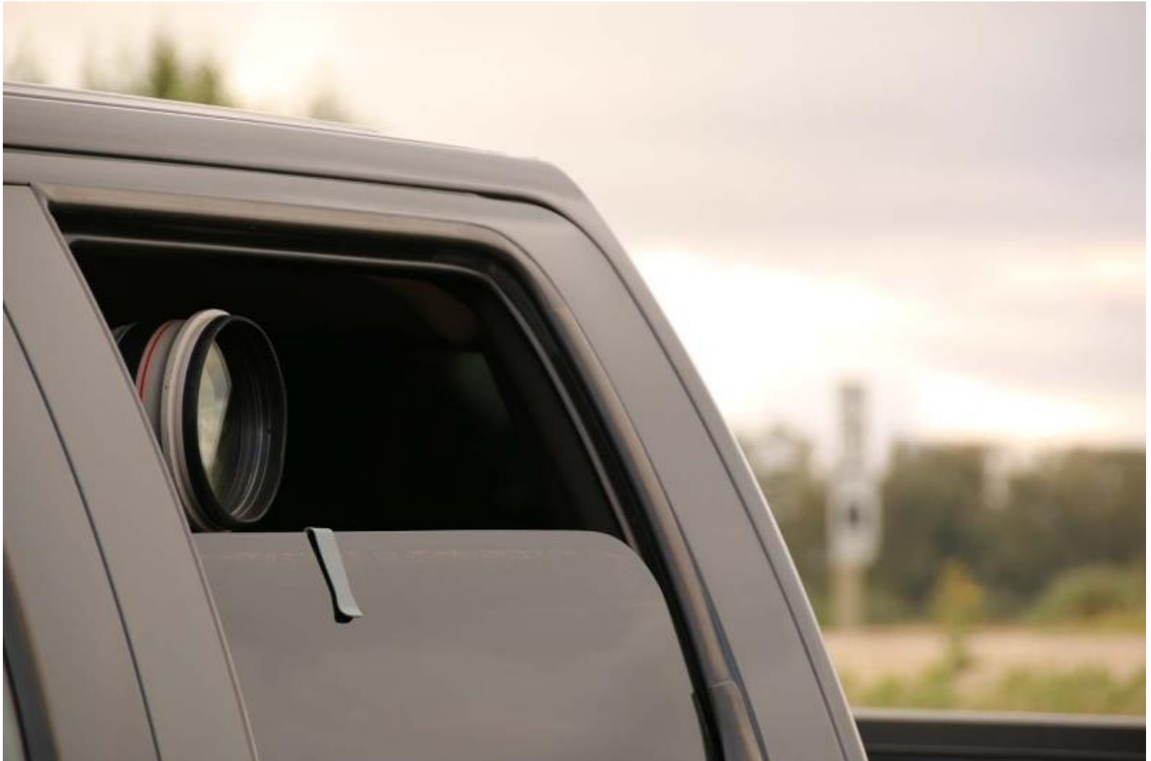
PHOTO ENFORCEMENT PROGRAM UPDATE